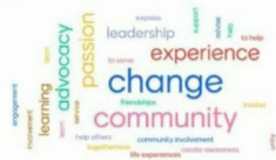
The photo above is a screenshot of the Mentimeter Icebreaker Activity from the first day of the Los Rios Summer Training Summit.

Why did you choose to get involved in student government?