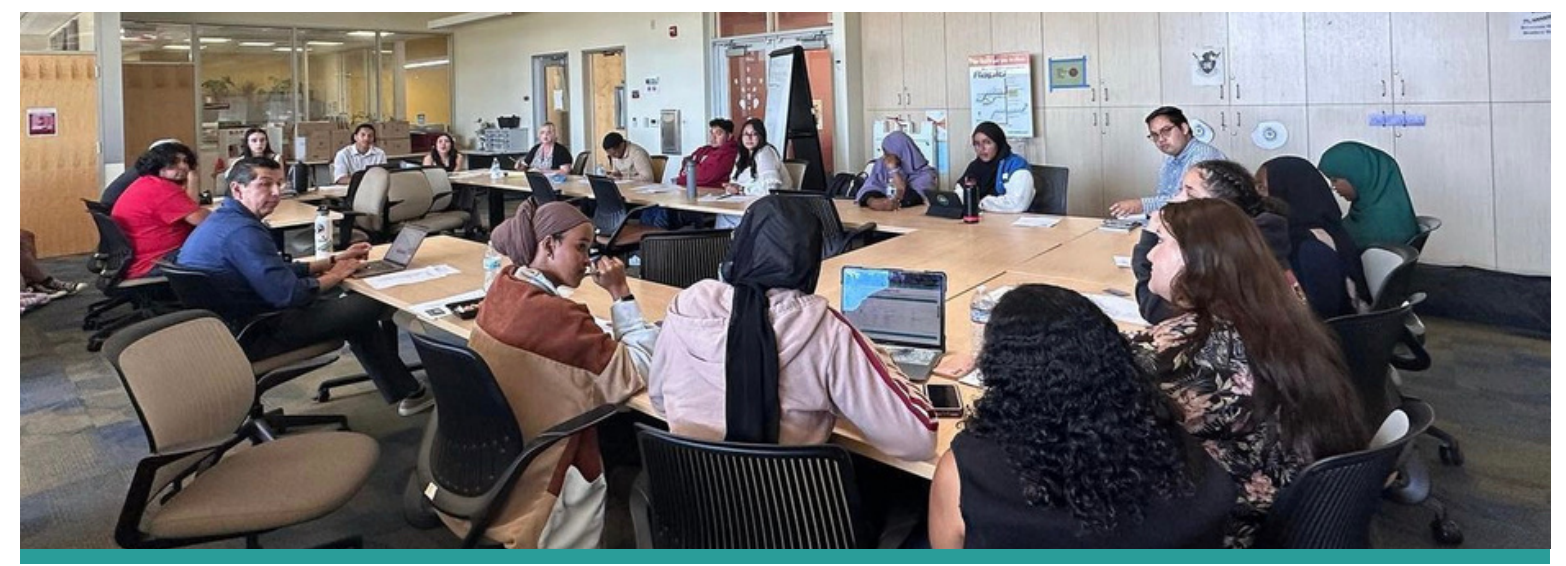
@cityasg - Hosting an ASG meeting ft. RAD X