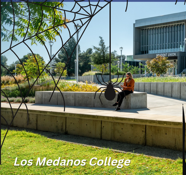
Los Medanos College