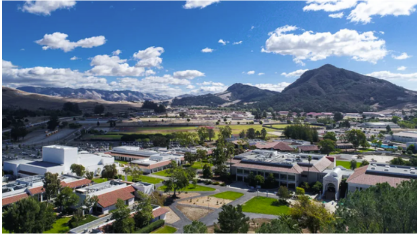
A view of Region VI's Cuesta College.