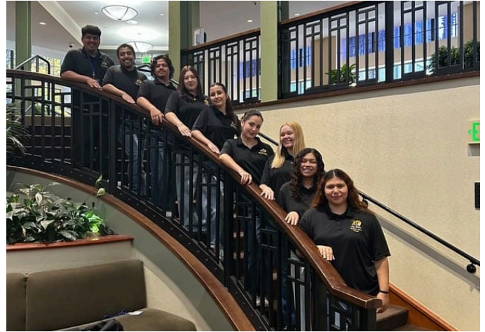
Taft ASO at Advocacy Academy

The event began with a regional summit, where Regional Officers came together for leadership training and to prepare for the weekend ahead.