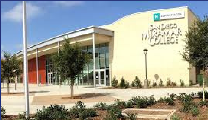
Location of December Delegate Assembly