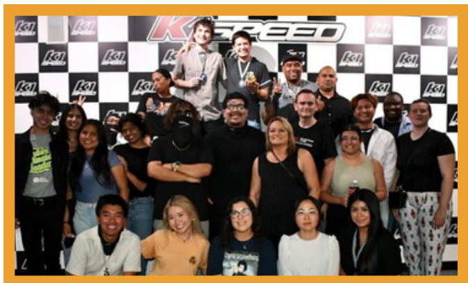
Board of Directors Meeting - August, 2024.