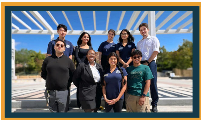
First Region VI Delegate Assembly - September, 2024.

If you are interested in being an alternate delegate and attend a community college within Region VI, please contact RADregionVI@ssccc.org to apply!