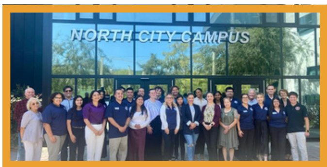
Board of Directors Meeting - September, 2024.