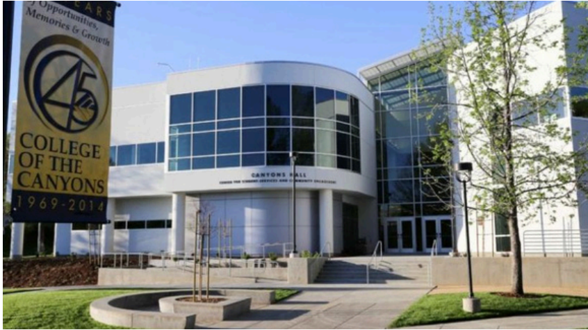
A view of Region VI's College of the Canyons