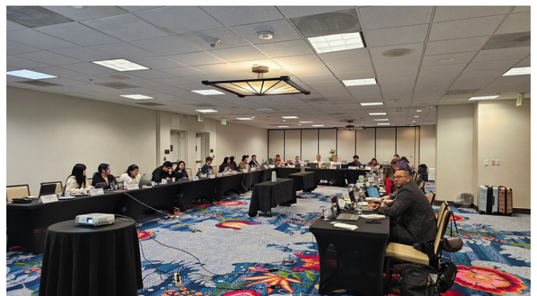
A sneak peak inside the Board of Directors training and meeting from March 8th and Saturday, March 9th