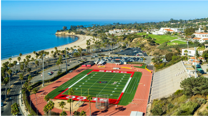
A view of Region VI's Santa Barbara City College.